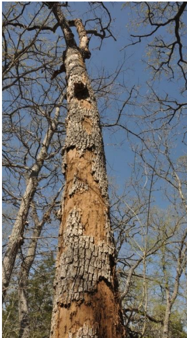
Brown fungus is Hypoxylon canker