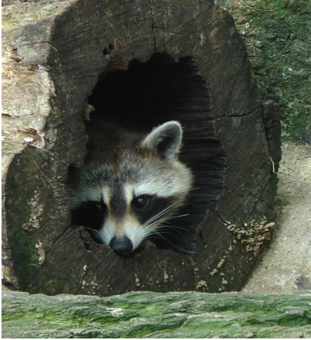
Cavities in trunks or branches