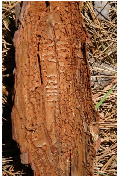
Engraver beetle galleries in loblolly pine bark