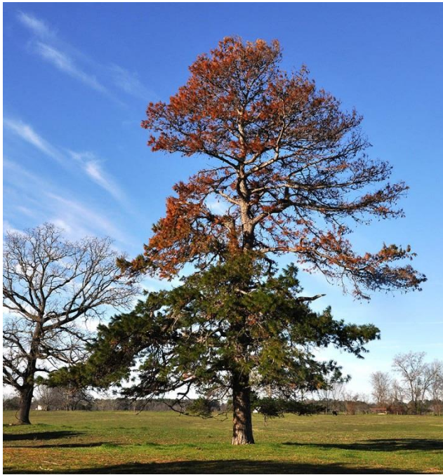
Pine attacked by engraver beetles