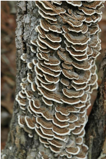
Mushrooms on trunk