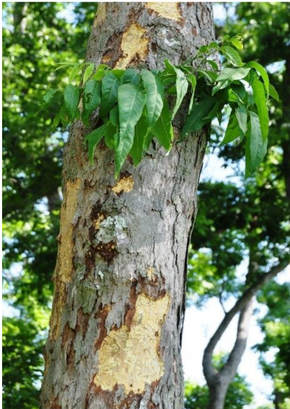
Soapberry borer infestation