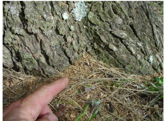
Boring dust in cedar elm