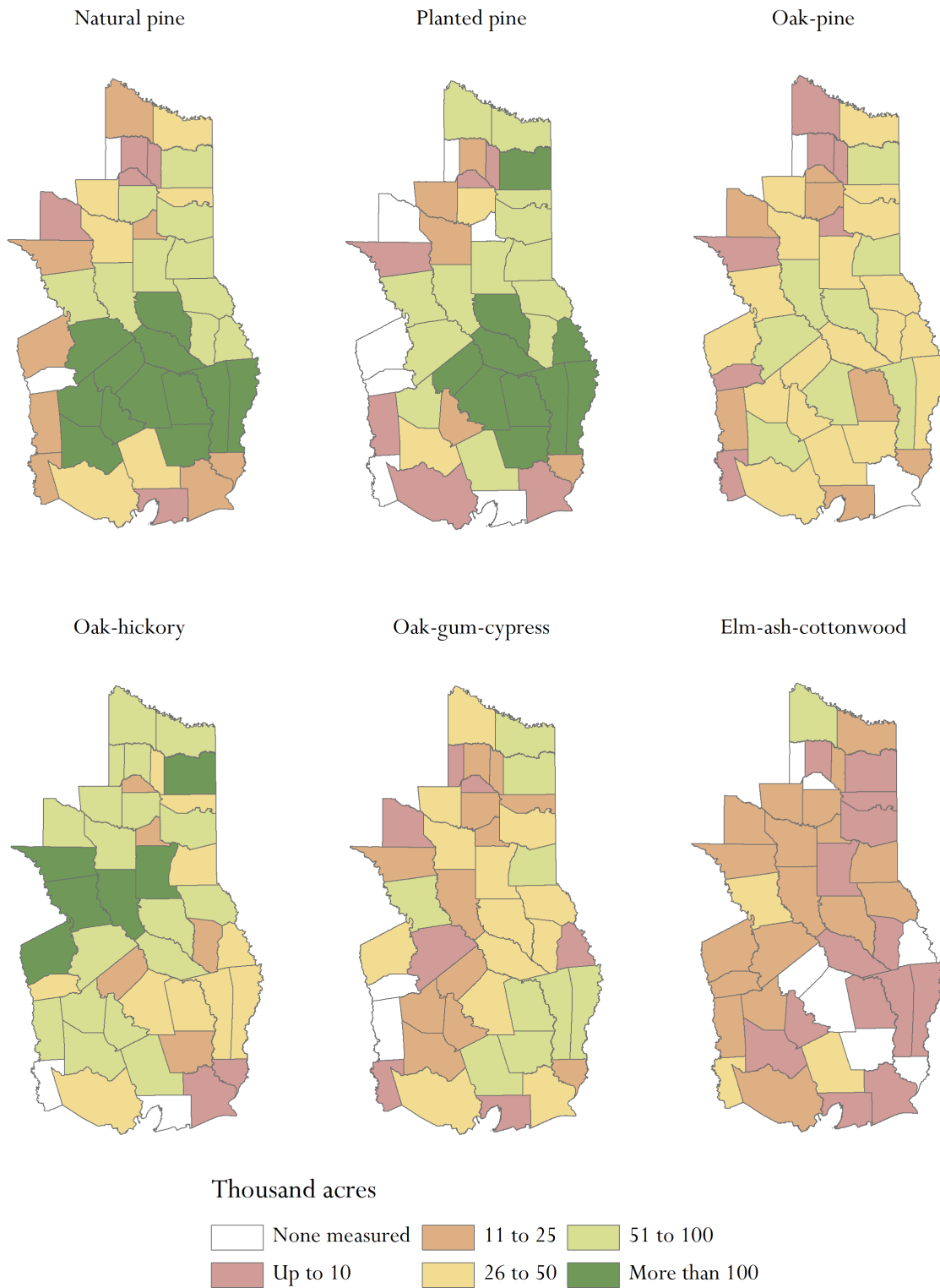
Figure A1—Total area of timberland by forest type and county, 2020. (See page 7 for definitions.)