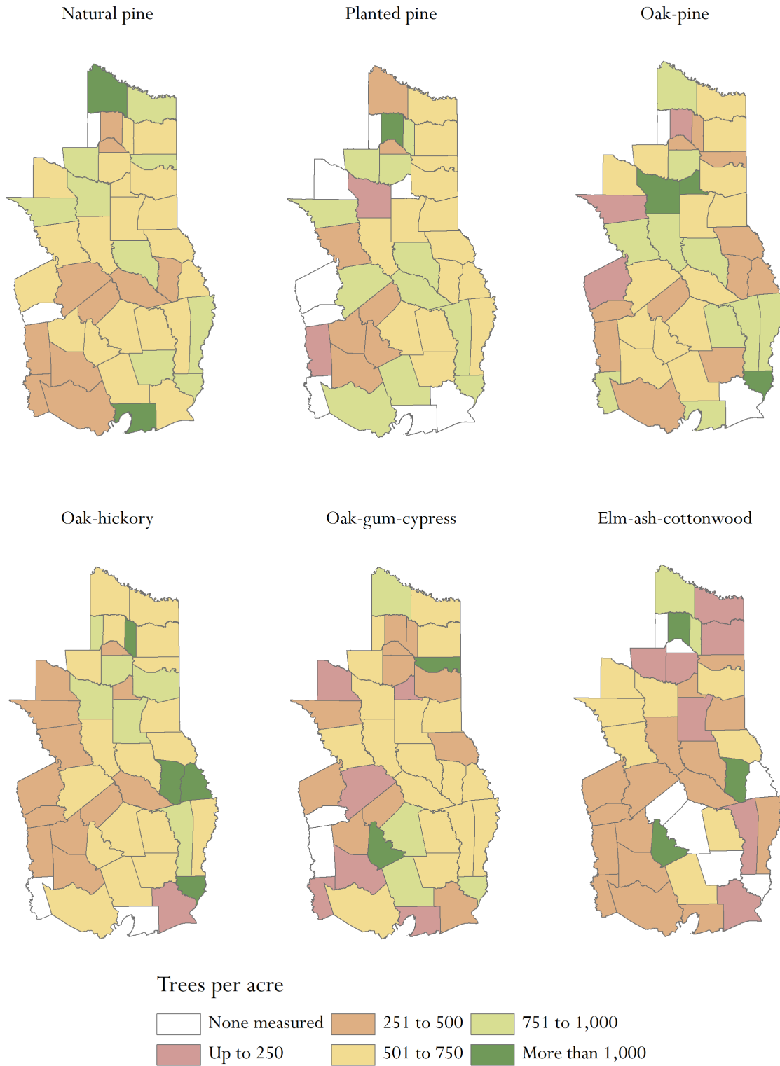
Figure A3—Average number of trees per acre by forest type and county, 2020. (See page 7 for definitions.)