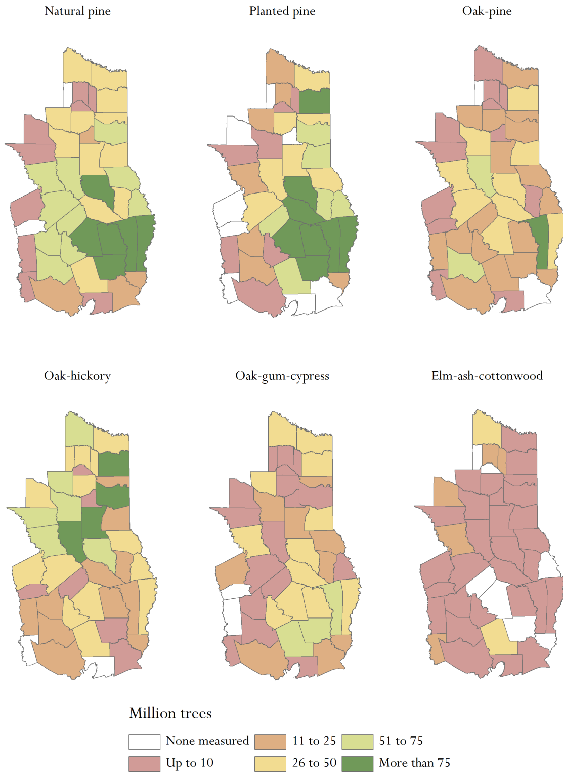
Figure A2—Total number of trees by forest type and county, 2020. (See page 7 for definitions.)