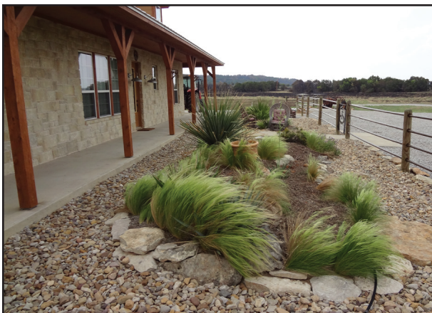
Native xeric landscaping allows water-wise practices to create a landscape that will flourish in hot and dry conditions.