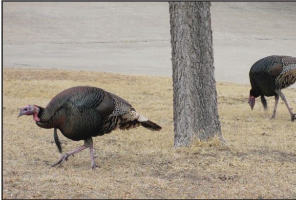
Landscaping provides habitat for wildlife.