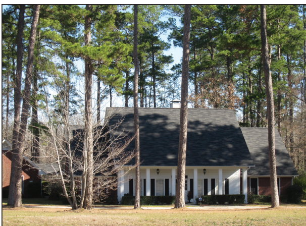
Landscaping reduces energy cost by providing shade from the home.

Firewise landscaping can be achieved along with other landscaping goals of landowners. Creating a safer Firewise landscape can easily fit into multiple goals just by using the right plants and proper spacing.