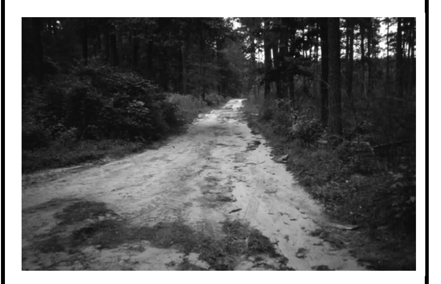
A washout like this can result from failing to maintain the road ditch and wing ditches.

Something as simple as maintaining the road ditches would have kept the water off of this road. The ditches were allowed to fill in with sediment causing the water to backup on the road.