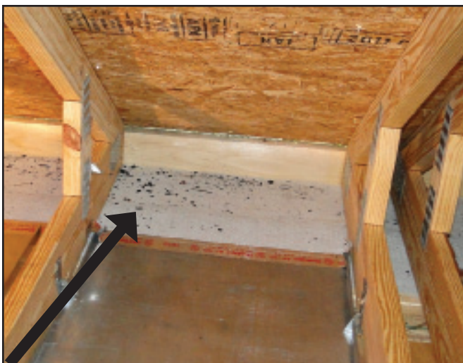
Without roof edge flashing, embers can enter into the attic.

Box in eaves with non-combustible material.