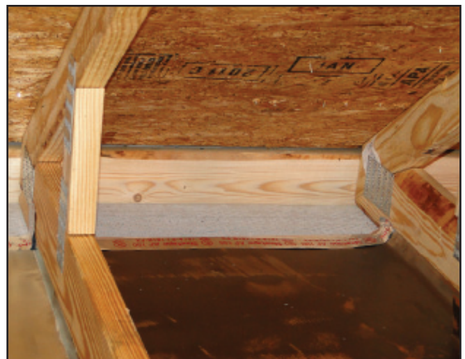
With roof edge flashing, fewer embers enter the attic area.