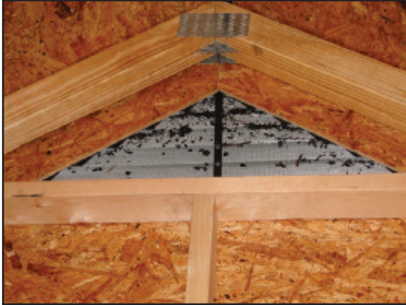
Screening helped capture these embers and prevent their entry into the attic.