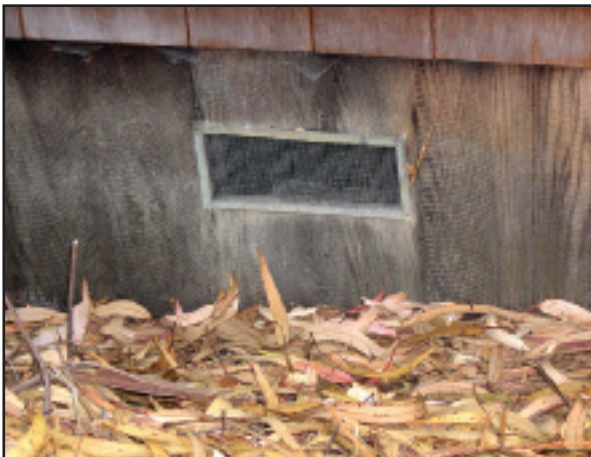
Combustible material like this mulch, near skirting or siding, leaves the home unprotected, even with screening in place.

There are several different types of vents for a home. These vents play a vital role by supplying openings for air to flow through. However, these vents can allow embers to enter a home during a wildfire.