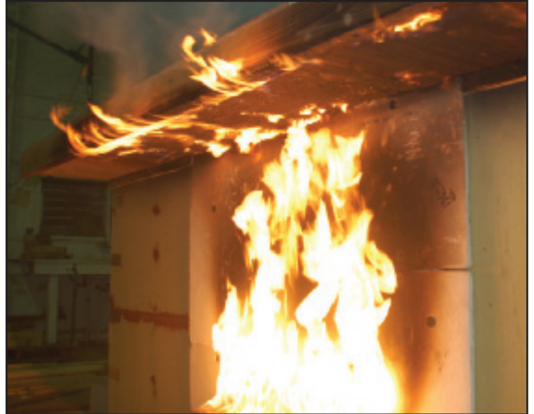
Direct flame on siding burns into the eaves and roof.

Angle flashing also should be used, as discussed in the roof section of this guide.